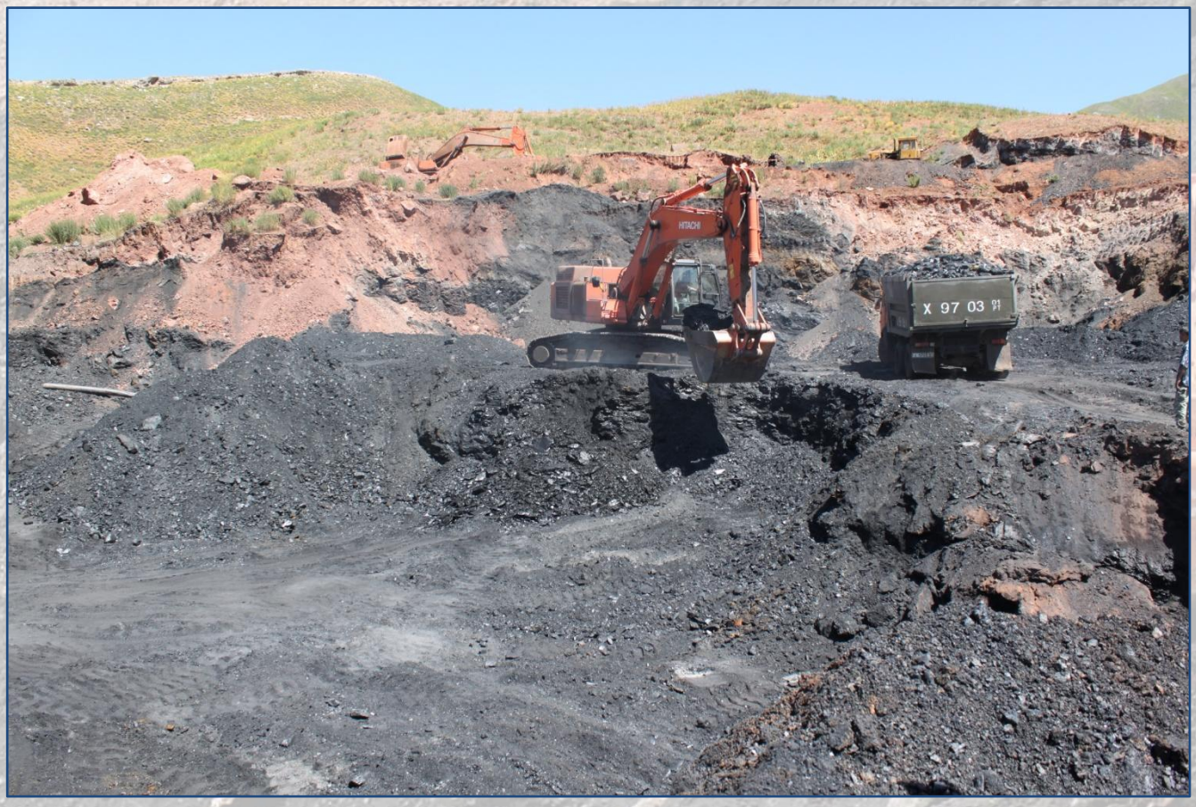
Zeddi's Thermal Coal Mining in progress